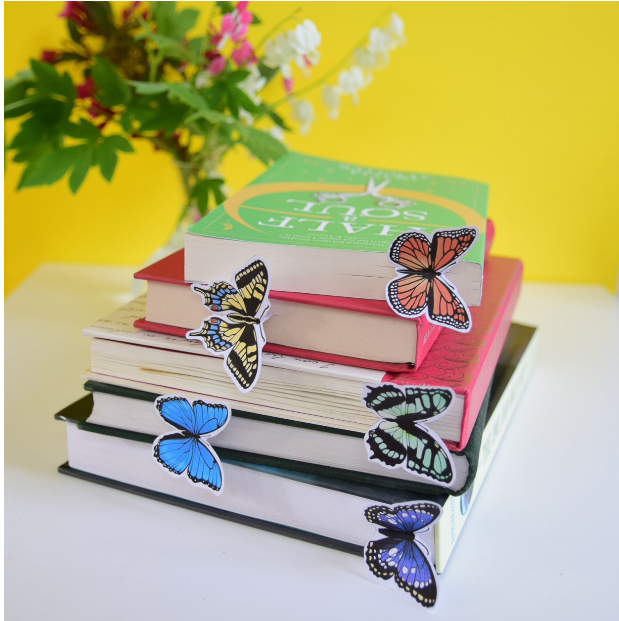
BUTTERFLY BOOKMARK SAMPLE